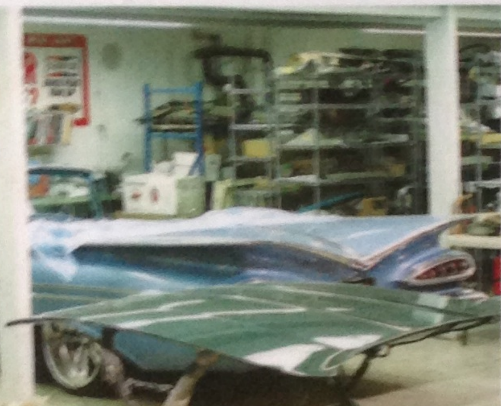
Still in the final assembly room is Schmidt's killer '59 Impala (future feature) with a 348 Tri-power under the hood and his equally jaw-dropping '57 Chevy with a 572 BBC for power.