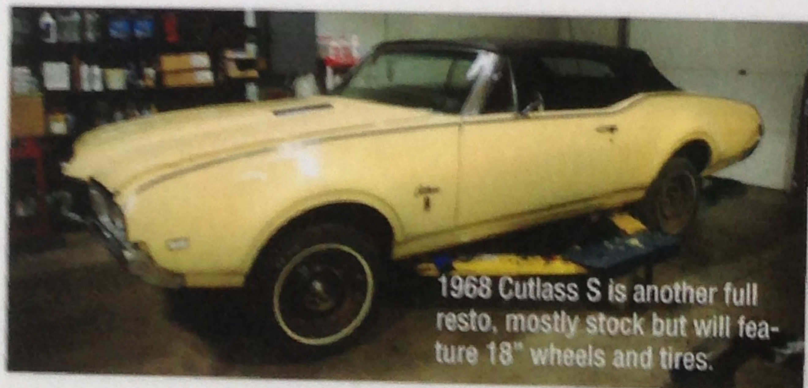
1968 Cutlass S is another full resto, mostly stock but will feature 18" wheels and tires.