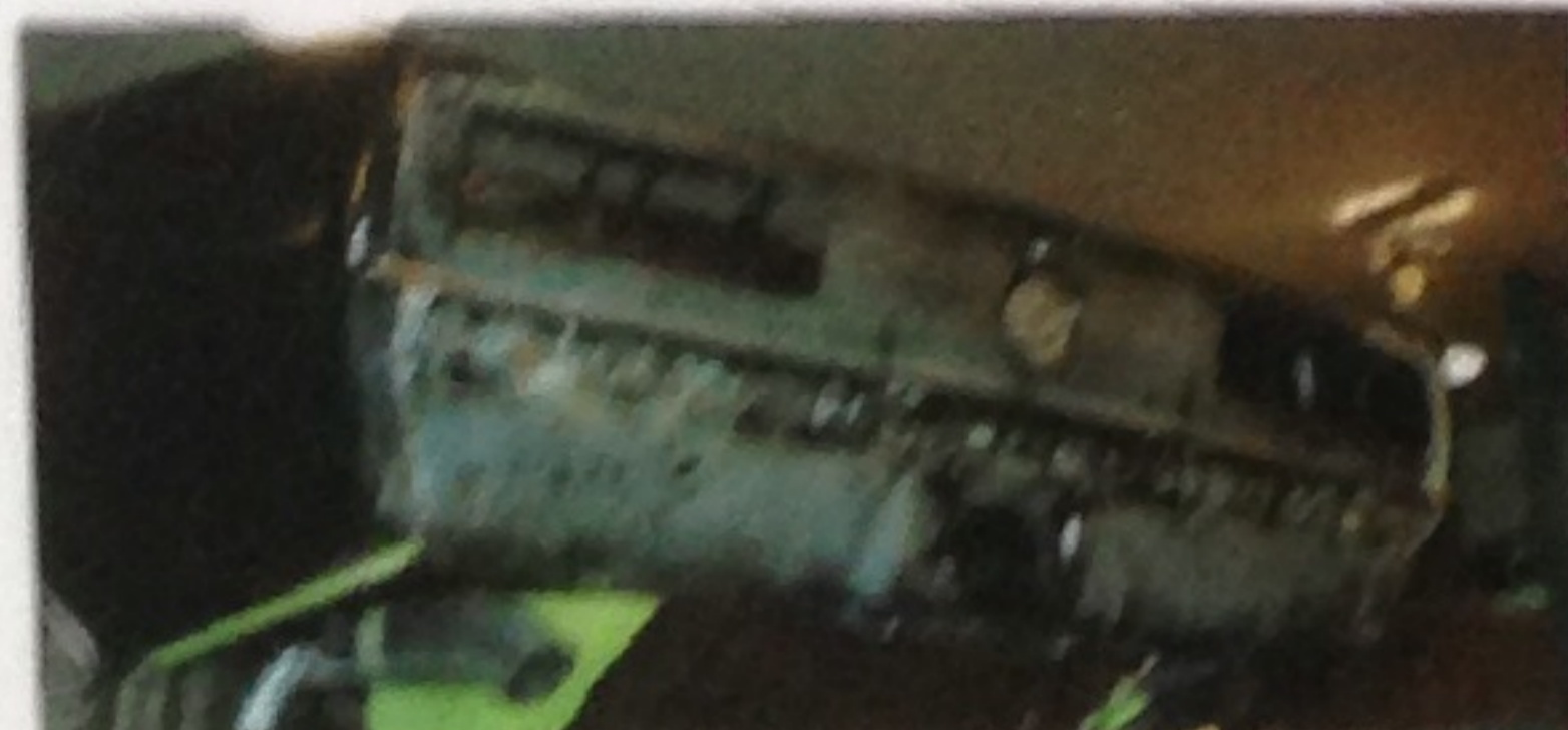
As a former professional athlete, Schmidt's shop attracts a lot of professional athletes. This '68 Camaro is being built for a current NHL star and features a 502 Ram Jet, SpeedTech suspension and 19" inch wheels front, 20" out back.