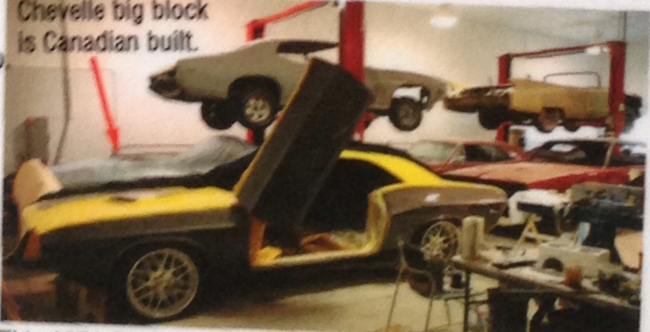
This 1971 Challenger is another one of Schmidt's old projects and sports a 440 6-pack under the hood.

Schmidt's 1969 Chevelle big block is Canadian built.