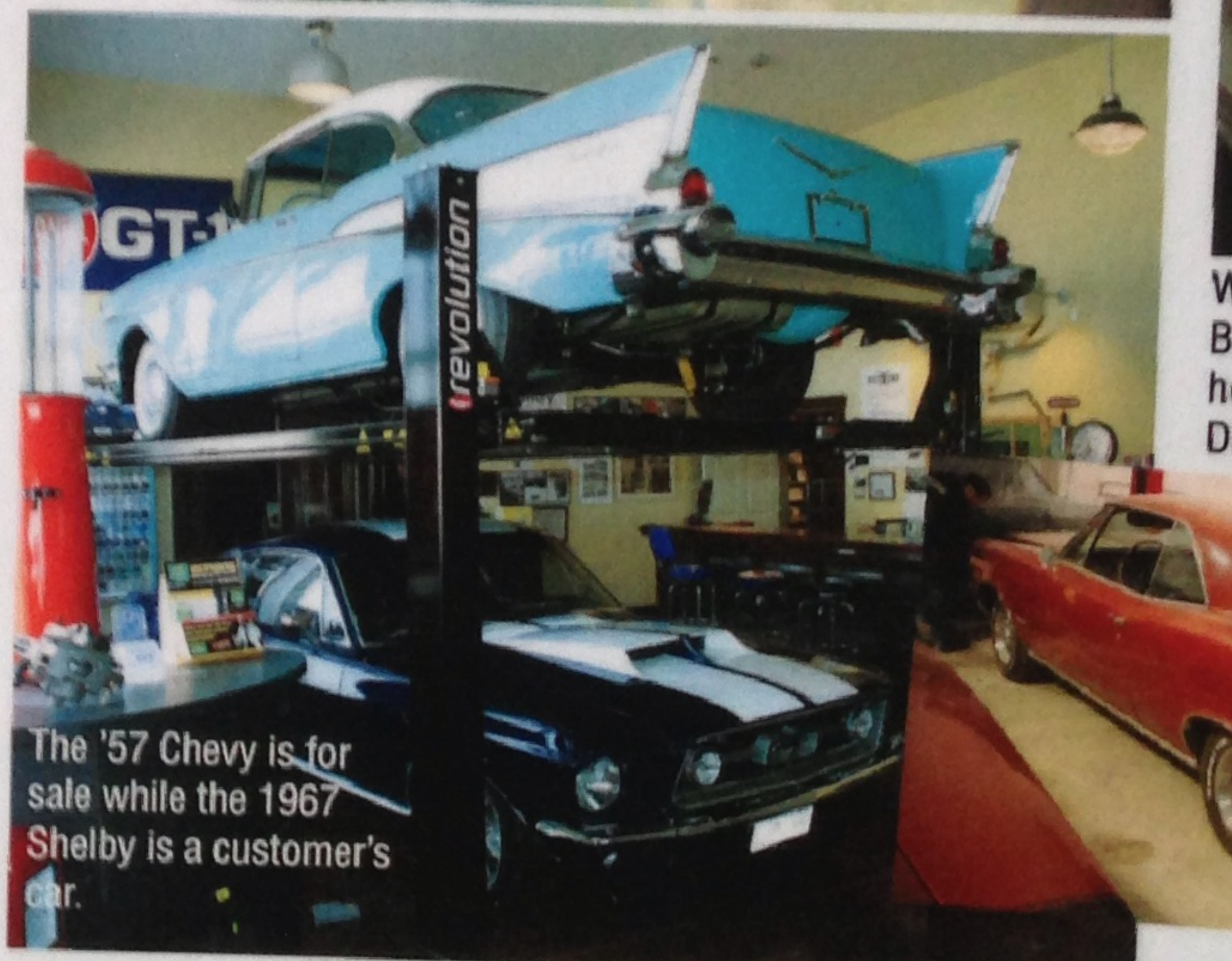
The '57 Chevy is for sale while the 1967 Shelby is a customer's car.