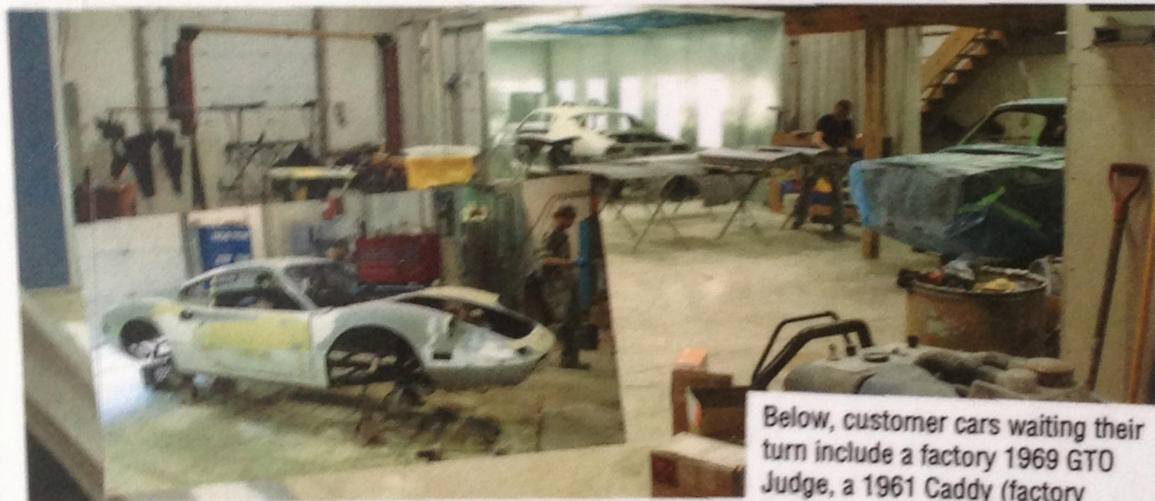
Below, customer cars waiting their turn include a factory 1969 GTO Judge, a 1961 Caddy (factory Dusty Rose car) and '69 Charger.

While American muscle is the staple the Boot Hill gang has the skill and know-how to tackle any project...even a 1972 Dino Ferrari. Below, '66 GTO awaits resto.